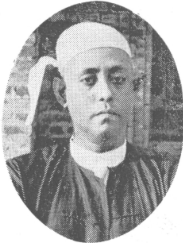
The Hon'ble U WIN, Minister of National Planning and Sasana Affairs Government of The Union of Burma