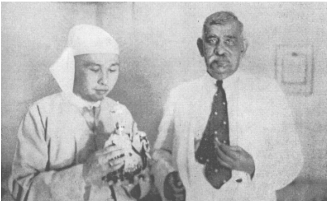
Two Prime Ministers, leaders of Buddhism as well as leaders of their countries: The late Hon'ble D.S. Senanayake who was Ceylon's leader until his tragic death by accident early this year, and U Nu, Hon'ble Prime Minister of Burma.