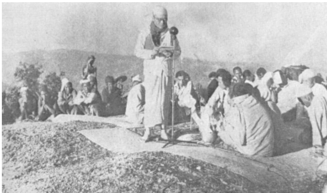
In another outlying part of the Union of Burma, The Chin Hills in the cold north, the Hon'ble U Nu, Prime Minister of the Union of Burma, recites Buddhist Scriptures after planting a sacred Bo sapling.