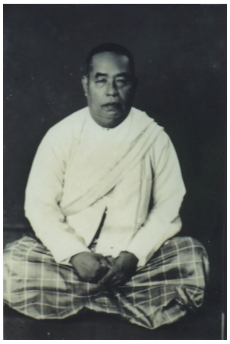
Sayagyi UBa Khin