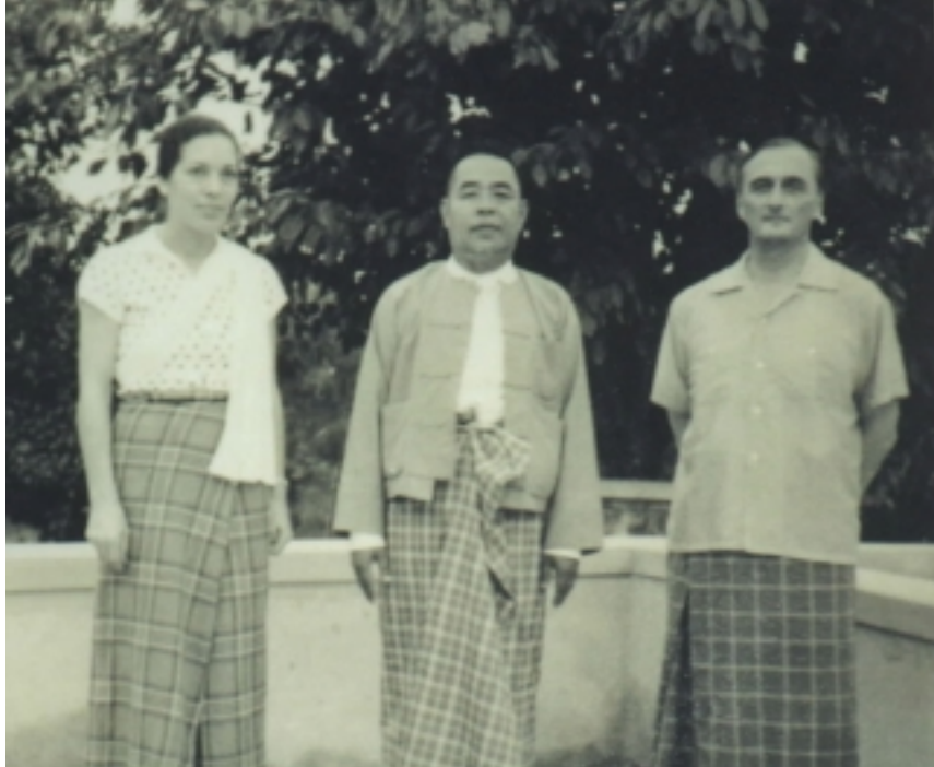
Above: Sayagyi's Pagoda. Below: Sayagyi with two of his foreign students