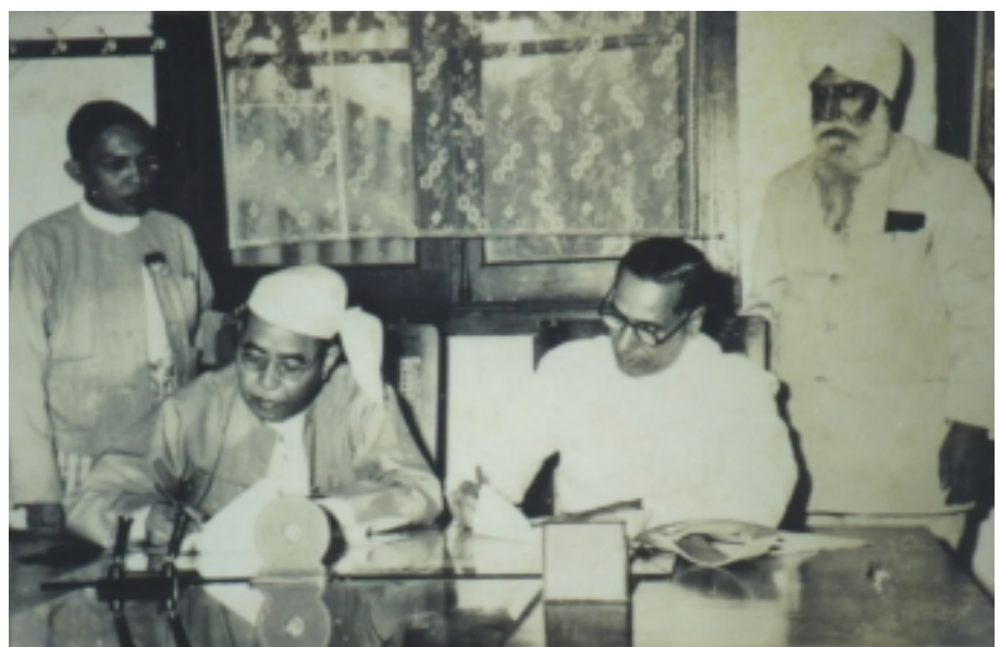
U Ba Khin—a tireless civil servent held as many as 4 official positions at once. The retirement laws of Burma were amended to say that the law applies to everyone except U Ba Khin: He must work!